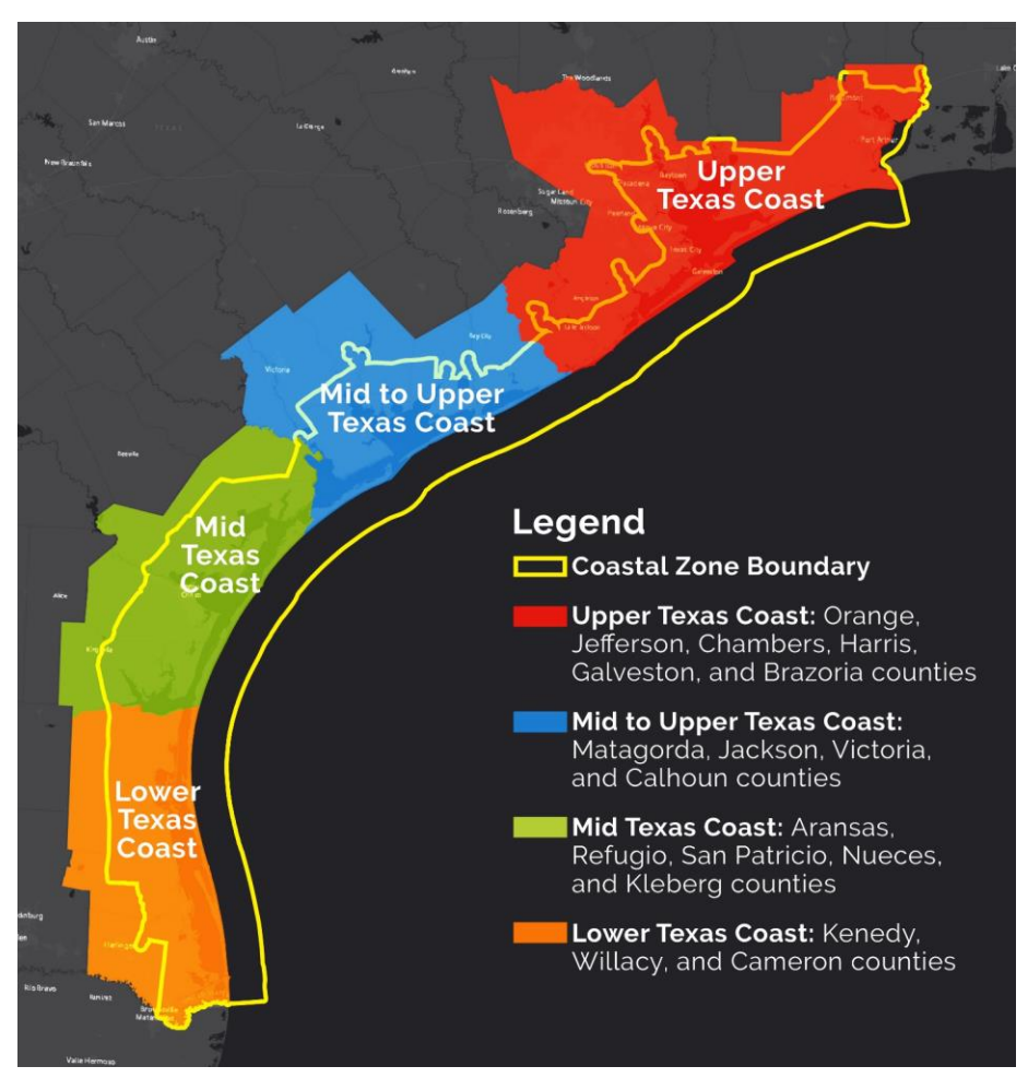
Figure 1. Coastal Texas Study Area

The U.S. Army Corps of Engineers, Galveston District (USACE), in partnership with the Texas General Land Office, have undertaken the Coastal Texas Protection and Restoration Feasibility Study (the Study), which is examining coastal storm risk management (CSRM) and ecosystem restoration (ER) opportunities within 18 counties of the Texas Gulf coast (Figure 1). This Study seeks to develop a comprehensive plan along the Texas coast to mitigate coastal erosion, relative sea level rise (RSLR), coastal storm surge, habitat loss, and water quality degradation.