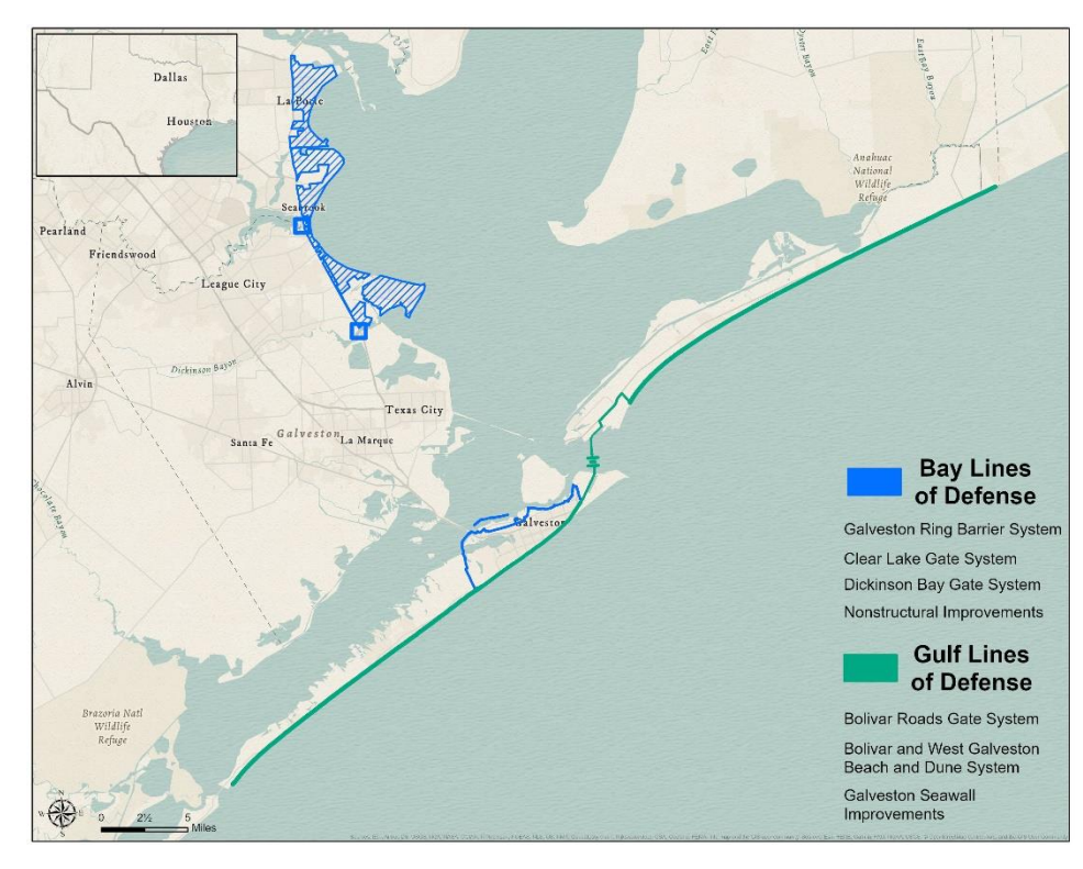
Figure 4. Galveston Bay Storm Surge System